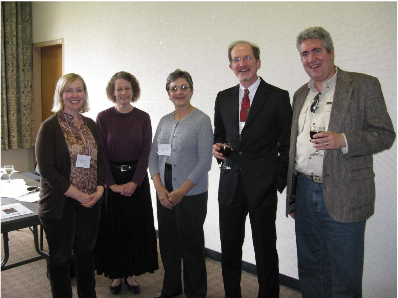
Celebrating the election of MAM officers in 2010.