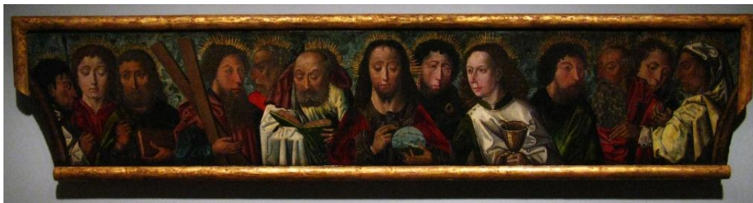
From the Cincinnati Institute of Art.