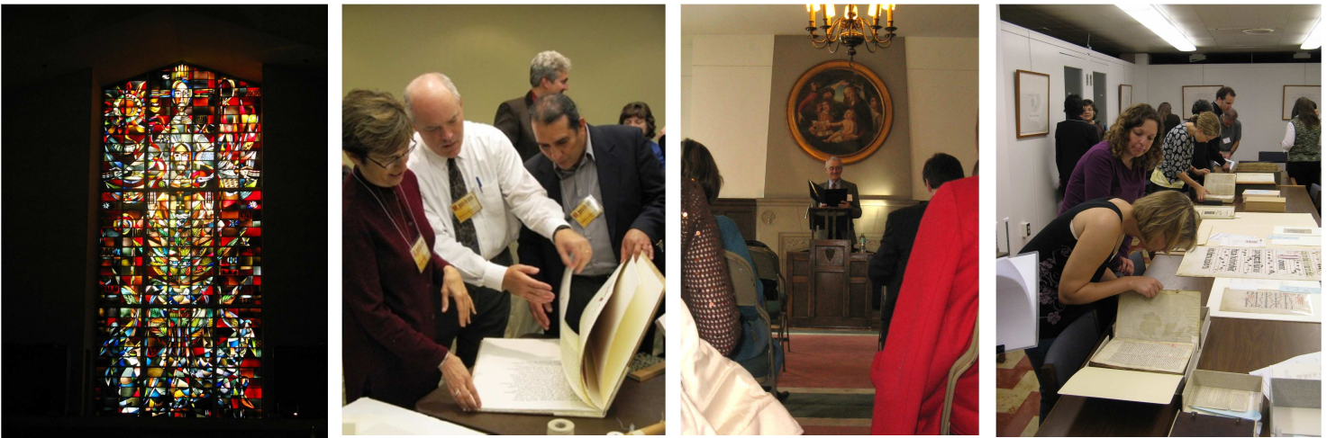
Scenes from past MAM conferences: St. Norbert Abbey (MAM 2011); MAM 2008 in Fargo, ND; MAM 2009 in River Forest, IL; MAM 2010 in Iowa City.

http://spain.slu.edu/about_slm_madrid/what_is_a_billiken.html