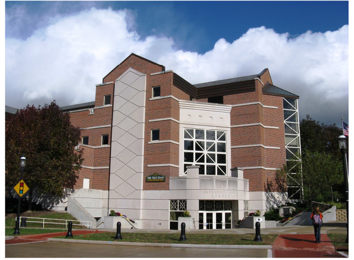
Scenes from lectures, the reception at the Institute for Norbertine Studies, Saint Norbert Abbey, and, of course, Saint Norbert himself.